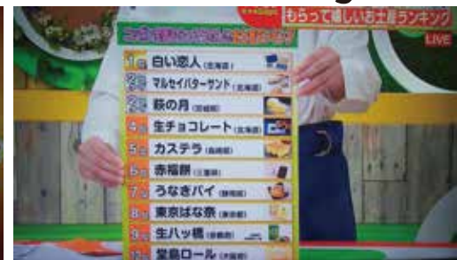
The souvenir rankings on TV Tokyo' s Yojigoji Days (May 25, 2022)