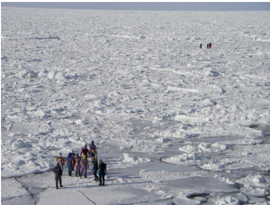
Kaminoko Pond Nature Walk