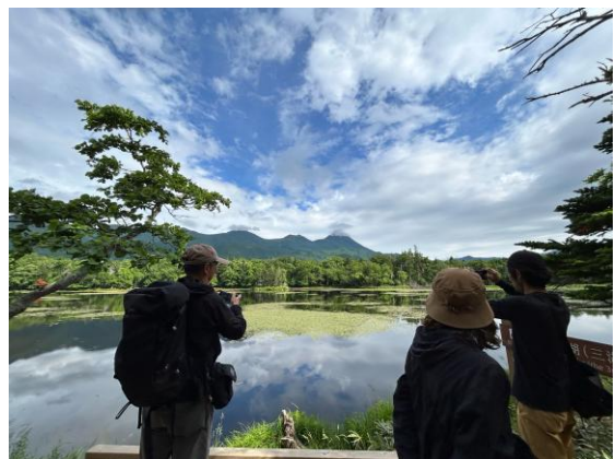
Scenic tour of Lake Mashu and Lake Kussharo