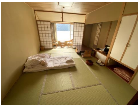
(Sample Picture of a Japanese Room)

Japan is a very famous country for Onsen (hot springs). Most ryokans have public baths where you can take a shower and bathe in the onsen. However, you must be careful as the water is quite hot and you may feel dizzy if you soak for too long. Remember to drink a good cup of water after bathing, as you will be dehydrated. In many of Japan's ryokans, a yukata is provided instead of pajamas. Yukatas are one-piece garments worn over your underwear (undershirt and socks are optional). Yukatas are typical Japanese robes. You may wear yukata to dinner, but this is optional. Your guide will show you how to wear the yukata when you check in.(Next page has more detailed steps on how to wear yukatas)At the hotel in Noboribetsu, you will be staying in a single room, but all the rooms are Japanese rooms with tatami mats. There are no beds in Japanese rooms, and we ask that you sleep on futons on the tatami mats. Futons are mattresses stuffed with cotton wool and covered with a duvet. When we don't use the futons, they are stored in the closets. During your dinner time, the hotel staff will come to your room and prepare the futon. If you need more mattresses, please let the hotel know.