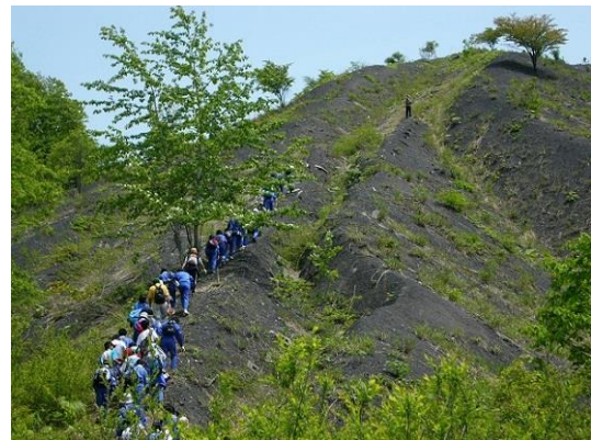
Hiking Mt. Racey