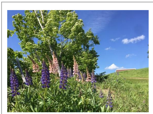
During the flower season, you will meet some beautiful flowers along the way