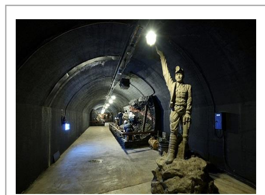
Inside the Coalmine Museum