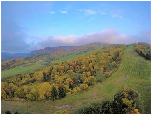
Scenery of Mt. Racey