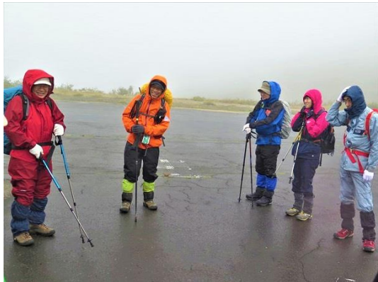
Guide and his members getting ready to start the hike