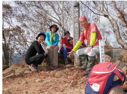
Our hiking guide and his hiking members