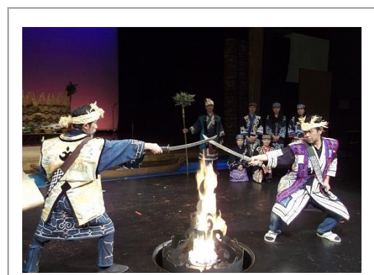
Cultural dance by the Ainu