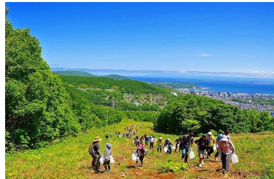
Beginning of the Hike