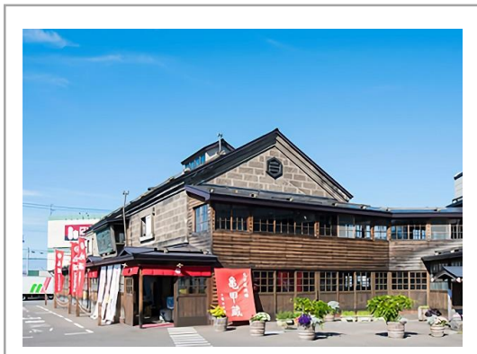
Tanaka Shuzo / Sake Brewery