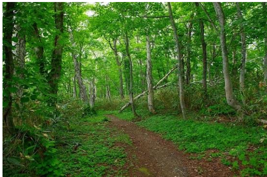
In the woods of Mt. Tengu