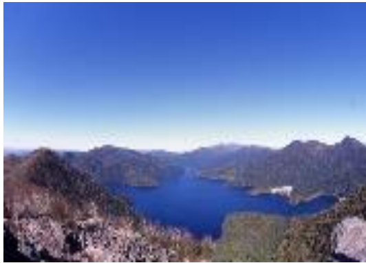
View of Lake Shikaribetsu from Mt. Haku'unzan