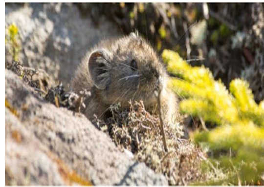
Pika – endangered animal living in wind caves