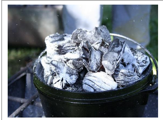
We will enjoy outdoor lunch using Dutch ovens