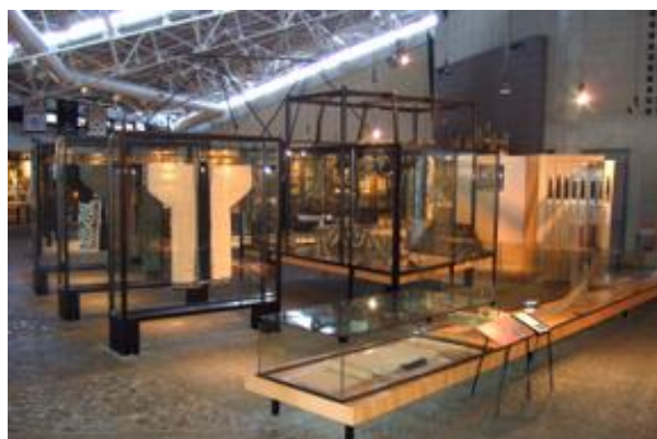
Nibutani Ainu Cultural Museum